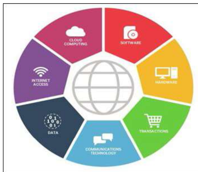
Figure 3: Smart City ICT Components (Margaret Rouse, 2017)

The smart ways of managing the things required acquiring the relevant data from various sensors, necessary data monitoring and analysis. The relevant data analytics from smart management of various services enables the city governance to make relevant improvements in infrastructure, super asset management and overall effective control on all the relevant resources. For this purpose, a smart city must include key components such as secure centralize server, safe way to access the data through mobile apps or simple secured websites and powerful hardware platforms to drive this IT Infrastructure. With such facilities the citizens can then freely and securely access the systems and subsequently required data and this can happen in two ways where citizens can also upload and update the relevant information in real time. By enabling the relevant controls citizens can contribute in information sharing and can collectively fulfill the combine aim of smart city governance.