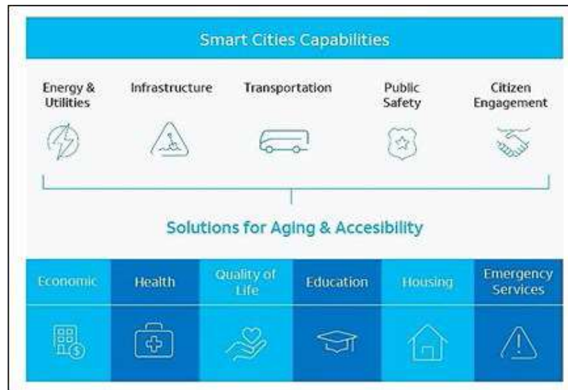
Figure 2: Smart City Capabilities (Panagiotis Tsarchopoulos, 2017)