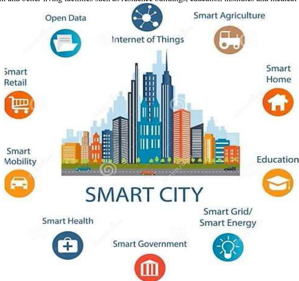
Figure 1: Smart City Model

In figure 1 below, the typical model representing smart city concept is shown. As shown in the figure, the key ingredients of smart city are shown around the basic residence infrastructure of a city and presented as a collection of paradigms spread among different domains such as people, processes, governance, mobility, environment and better living facilities such as residence buildings, education institutes and medical facilities.