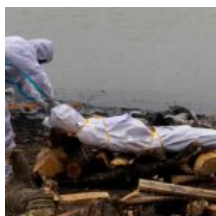
Morbid Matters: Estimating COVID-19 Mortality