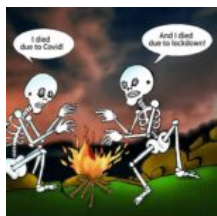
Post-Pandemic & Marginalization Among PVTGs: Untold Story from Palamu