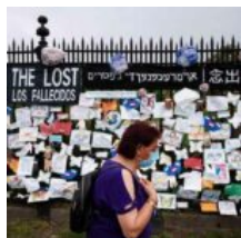
Pandemic is not over yet by a long shot: Deaths rose every week in 2022