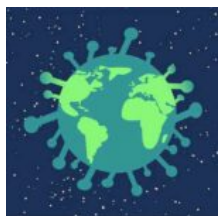
My Pandemic in Three Acts