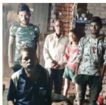
The Double Whammy of Hunger and Livelihood Crises after Covid-19