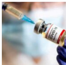
Asia continues to see disparities in access to vaccines: People's Vaccine Alliance – Asia